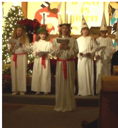
Above: Lucia 2008.